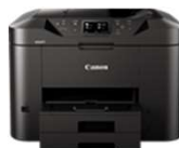
MAXIFY MB2750 series